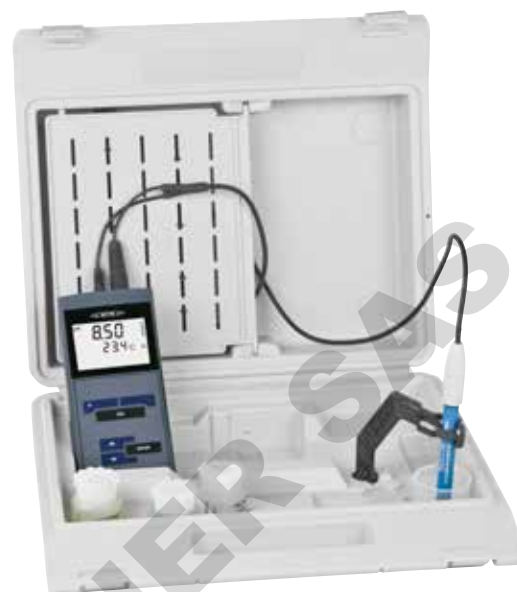
Set in case

The case also serves as a small field laboratory.