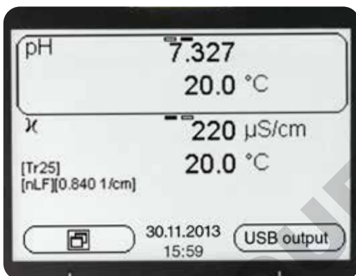
Display with two measured values