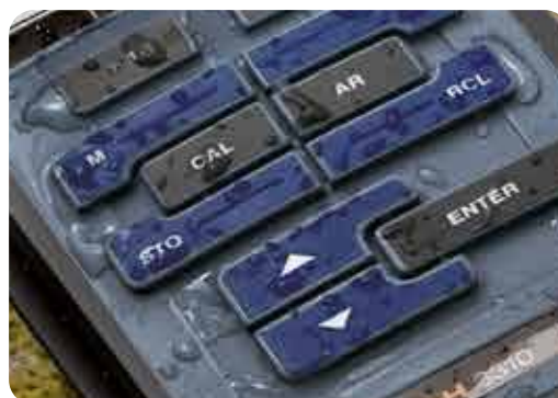
Robust sealed silicone keypad - 100% waterproof

Ease-of-use guarantees dependable results whether measuring surface water or the chemical process.