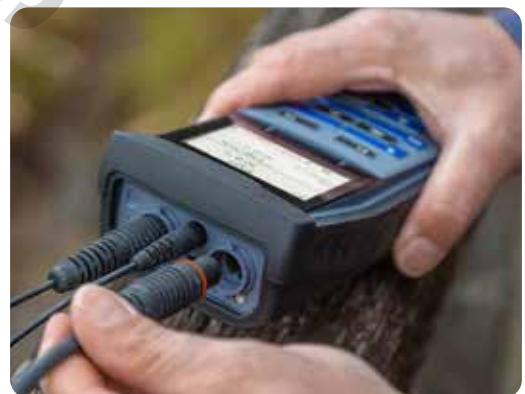
With waterproof mini USB-B interface for up-to-date data transfer.