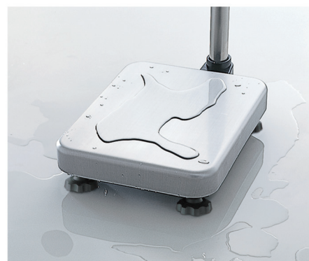
IP65 base unit with a SUS430 pan

In addition to being intrinsically safe, the base unit of the HV-CEP/HW-CEP series can be washed with water and can weigh wet objects without problems. Further, the surface of the pan is resistant to chemicals, scratches and rust, and easy to keep clean and hygienic.