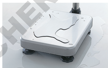
IP65 base unit with a SUS430 pan

The base unit can be washed with water, not to mention that wet objects can be weighed with no problem. Further, the surface of the pan is resistant to chemicals, scratches and rust, and easy to keep clean and hygienic.