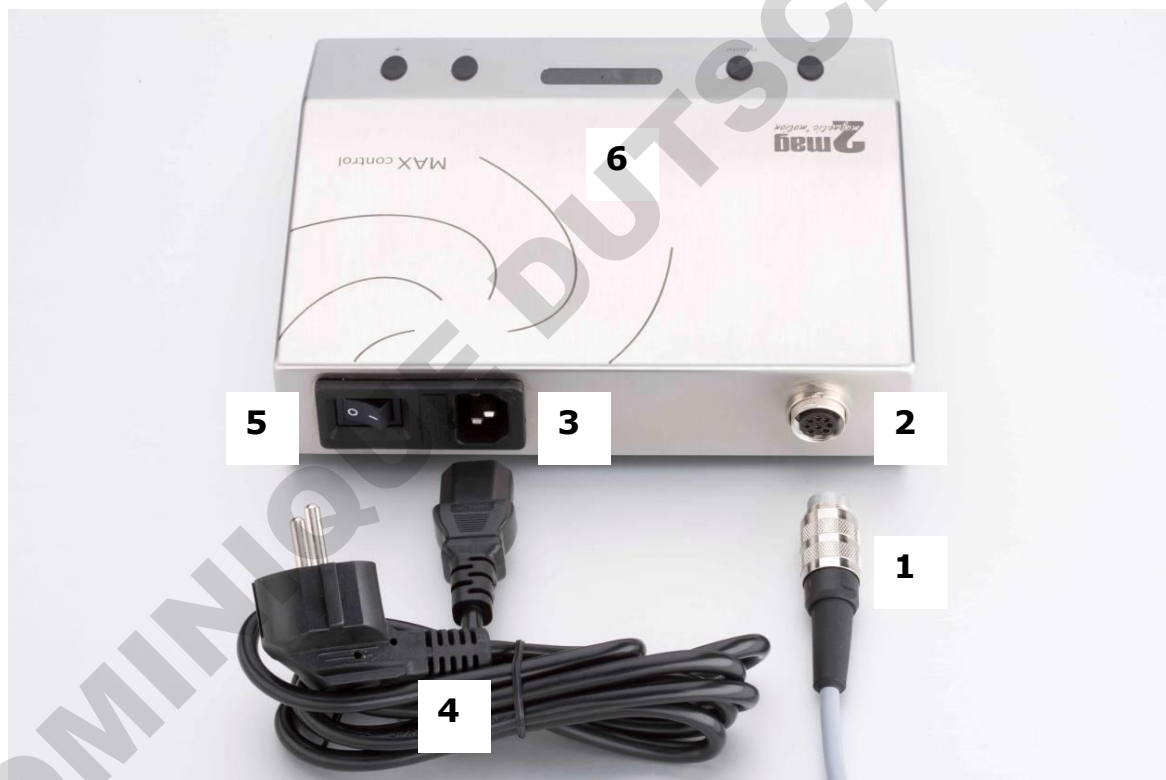
Image 2: Installation, rear side of the control unit MAXcontrol / FABcontrol