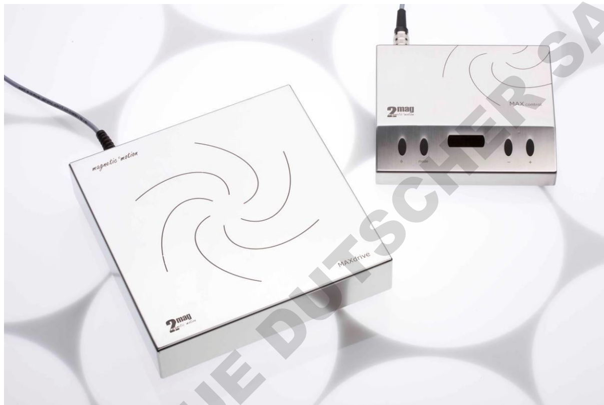
Image 1: 1-position magnetic stirrer MAXdrive with control unit MAXcontrol

Magnetic stirrer MAXdrive with control unit MAXcontrol Magnetic stirrer FABdrive with control unit FABcontrol