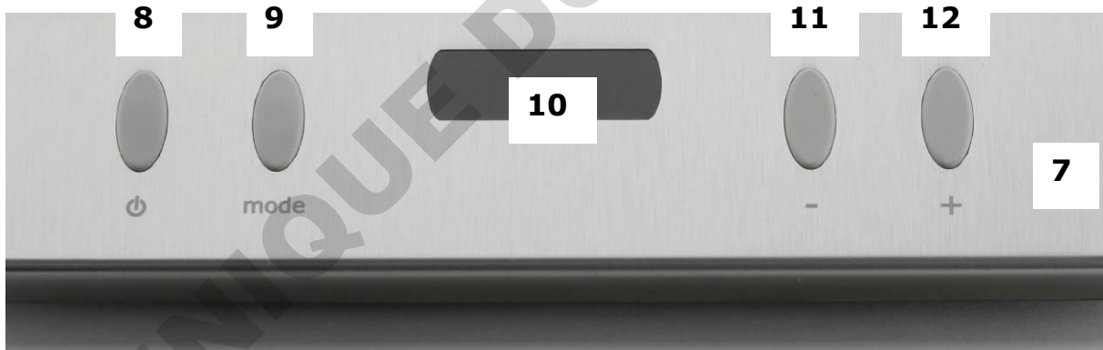
Image 3: Close-up, operating elements, control unit MAXcontrol / FABcontrol