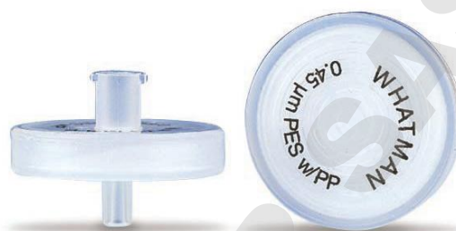
GD/XP Syringe Filters

GD/XP Syringe Filters contain 3 filtration layers which substantially reduce blockage and increase volume throughput. Layer 1 is a 20 µm polypropylene filter; layer 2 is a 5 µm polypropylene filter; layer 3 is the membrane filter, such as nylon, PVDF, PTFE, etc., which filters down to 0.45 µm.