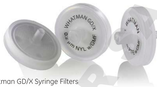
Whatman GD/X Syringe Filters

The Whatman GD/X range is specifically designed for high particulate-loaded samples. Constructed of a pigment-free polypropylene housing with a prefiltration stack of Whatman GMF 150 (graded density) and GF/F glass microfiber media, these filters allow you to filter even the most difficult samples with less hand pressure. Whatman GD/X Syringe Filters can process three to seven times more sample volume than a syringe filter containing a single filtration layer.