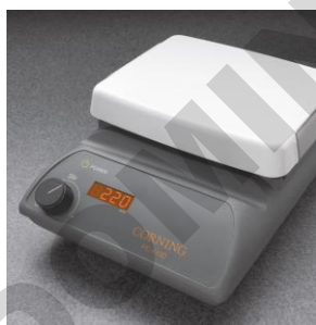
Model PC-410D shown