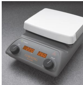
Model PC-420D shown