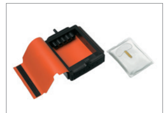
Dräger TO 7000 For safe and easy opening of your Dräger-Tubes