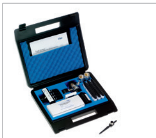
Dräger Aerotest systems

Dräger Safety has developed a range of measurement systems to meet the requirements of your different applications, and put them together as complete sets. The Dräger-Tube kits deliver fast and efficient results.