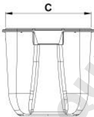
Drawing only exemplary