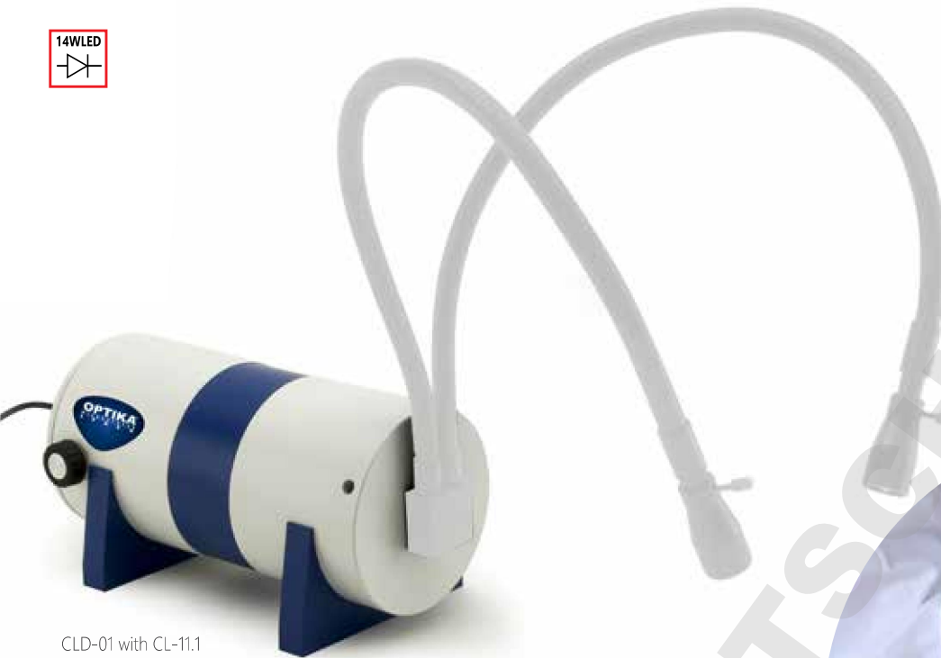
CLD-01 with CL-11.1

Flexible and professional cold light illuminator with high power, extra-efficiency 14W LED system, extremely bright and uniform . Optical power: 1000 lumen . Brightness control potentiometer, external power supply.