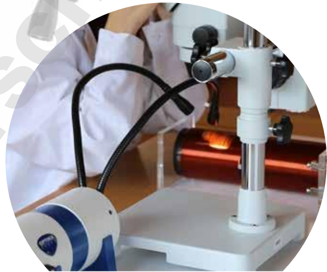
Mechanical component CLD-01 + CL-11.1

Flexible and professional cold light illuminator with high power, extra-efficiency 14W LED system, extremely bright and uniform . Optical power: 1000 lumen . Brightness control potentiometer, external power supply.