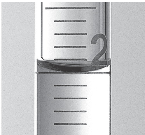
Meniscus adjustment with ring mark

Read at the lowest point of the meniscus.