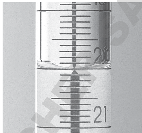
Meniscus adjustment with Schellbach stripe

Read at the lowest point of the meniscus.