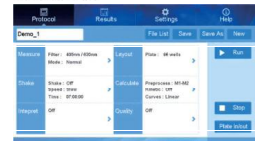
AMR-100 Operation Interface