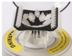
02 Mini-6KS 3-in-1 rotor