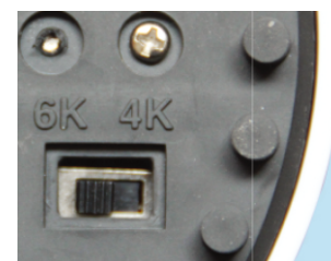
04 Mini-6KC/Mini-6KS/Mini-6KT Two speed options