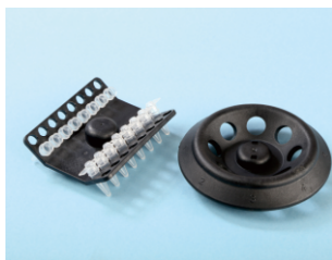
01 Mini-6KC quick release rotor