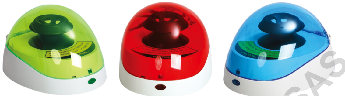
Mini-6K / Mini-7K / Mini-10K