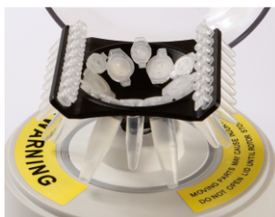
02 Mini-6KS 3-in-1 rotor