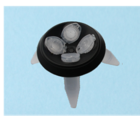
03 Mini-6KT 4x5ml tube rotor