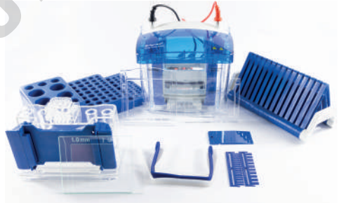
Components of the FastGene® PAGE Protein System gel electrophoresis set (PG01)