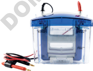
The FastGene® PAGE Protein System - Electrophoresis tank and lid