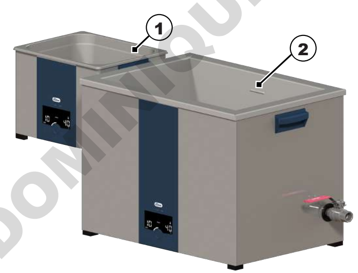
Illustration 5: Elmasonic Select 30-900 fill level marking

CAUTION! An overfilled tank can cause the cleaning fluid to boil over at high temperatures.