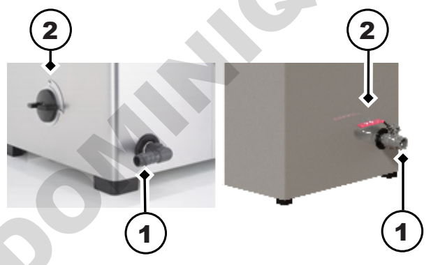
Illustration 6: Drain of Elmasonic Select 60–300/500/900

→ The unit is emptied, cleaned and, where necessary, disinfected.