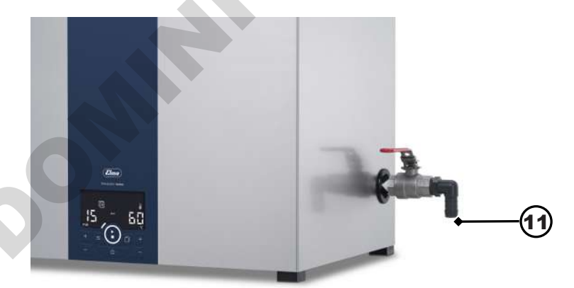
Illustration 3: Drain of Elmasonic Select 500/900