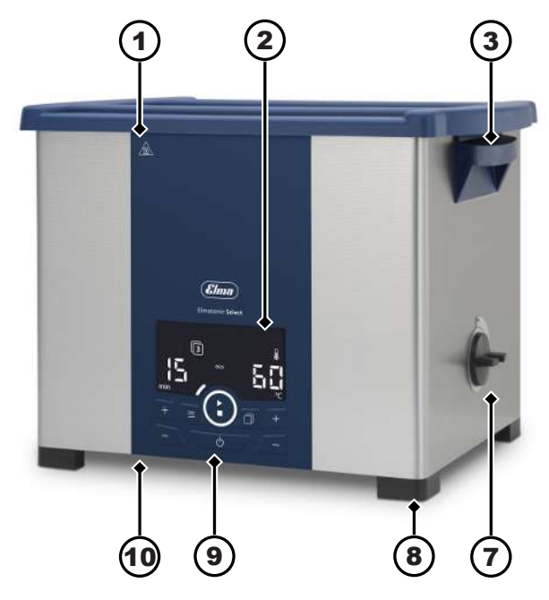
Illustration 2: Operating side/rear side