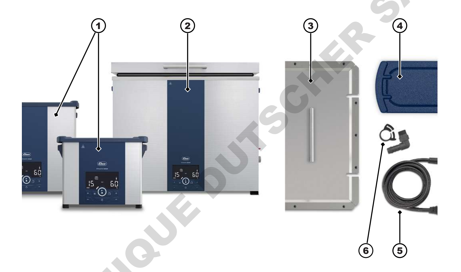
Illustration 1: Included items (schematic diagram)

Dispose of packaging materials that are no longer required in an environmentally friendly manner.