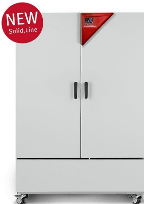
Model KBF-S 720