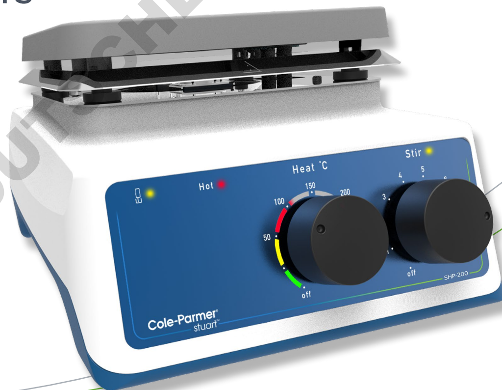
Hot Plate Stirrer SHP-200