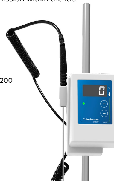
Temperature Controller HP-200/SHP-200

BioCote® utilises silver ion, copper, zinc and organic additives to provide built-in antimicrobial protection; so the Cole-Parmer® Stuart® range can support a safer and more hygienic laboratory environment. By reducing levels of bacteria, mould and fungi, your BioCote® protected piece of equipment can help reduce the risk of cross-contamination and consequently disease transmission within the lab.