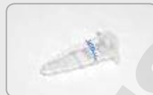
0.2 ml tube