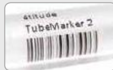
text + linear barcode