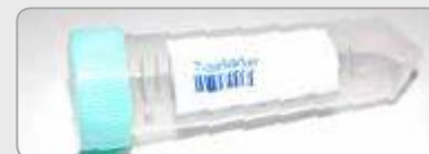
50 ml tube