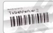
text + wide linear barcode