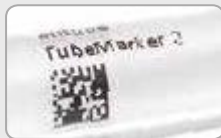
text + datamatrix code