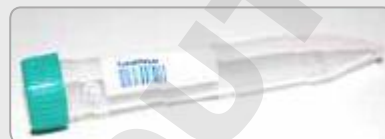
15 ml tube