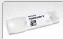
2 ml cryo tube