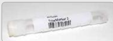
5 ml cryo tube