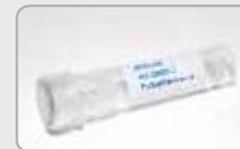
2 ml screw cap tube