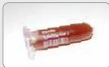
2 ml microcentrifuge tube