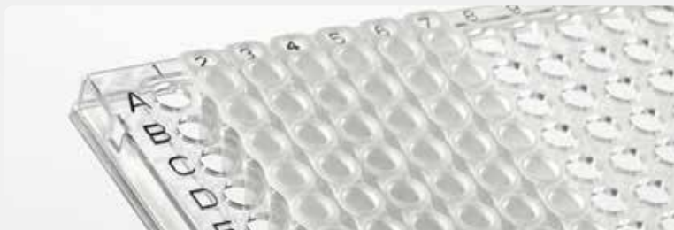
4ti-0950-F Vari-Strip™ 480/96 frame for Roche LightCycler 480