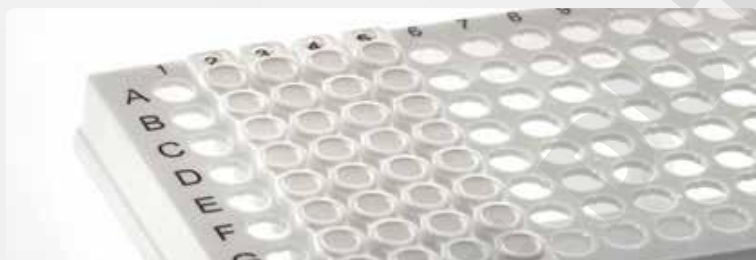
4ti-0757-F Universal fully skirted plate