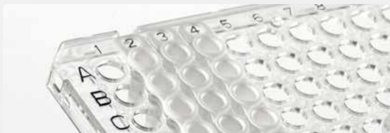
4ti-0910-F Vari-Strip™ FastBlock frame for ABI Fast Block