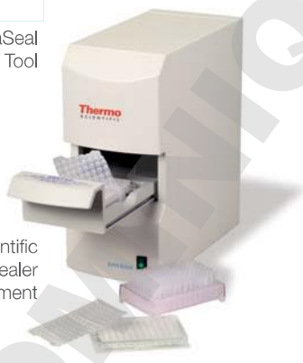
Thermo Scientific SuperSealer Instrument