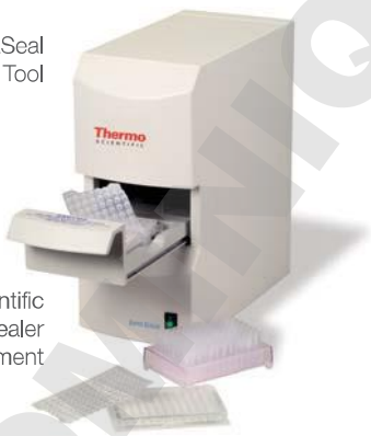
Thermo Scientific SuperSealer Instrument