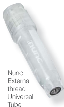
Nunc External thread Universal Tube