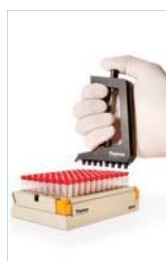
SepraSeal Removal Tool