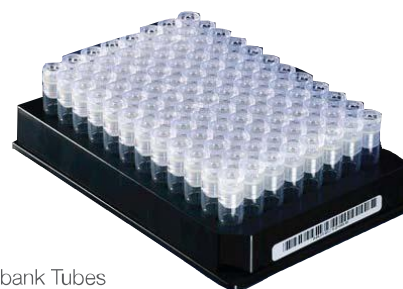
Nunc Cryobank Tubes in black locking rack