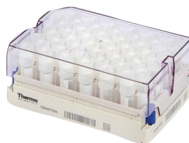
Nunc External Thread tube racked