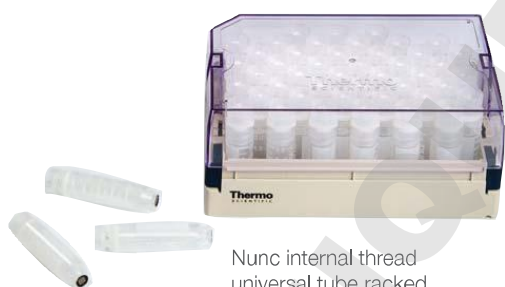
Nunc internal thread universal tube racked