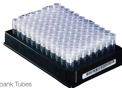
Nunc Cryobank Tubes in black locking rack