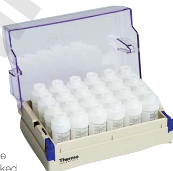
Nunc Low Profile 5.0mL Tube racked