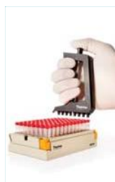
SeptaSeal Removal Tool

Thermo Scientific™ Matrix™ SeptraSeal™ septa enables individual tube capping plus the ability to apply 96 septa at once and store down to -20°C. Pre-split SeptraSeal septa can be pierced multiple times. Permanently installed Thermo Scientific™ Matrix™ DuraSeal™ septa enable long-term storage at temperatures down to -150°C.