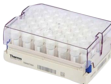
Nunc External Thread tube racked