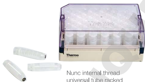
Nunc internal thread universal tube racked