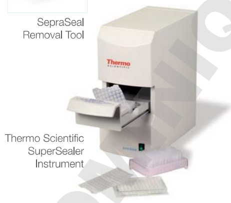
Thermo Scientific SuperSealer Instrument