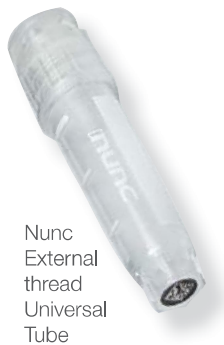
Nunc External thread Universal Tube