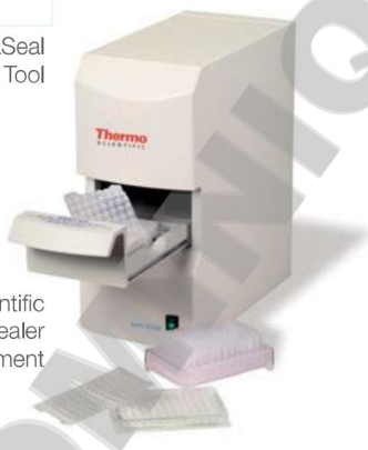
Thermo Scientific SuperSealer Instrument