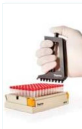
SepraSeal Removal Tool

Thermo Scientific™ Matrix™ SepraSeal™ septa enables individual tube capping plus the ability to apply 96 septa at once and store down to -20°C. Pre-split SepraSeal septa can be pierced multiple times. Permanently installed Thermo Scientific™ Matrix™ DuraSeal™ septa enable long-term storage at temperatures down to -150°C.