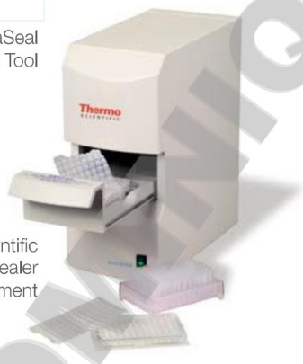
Thermo Scientific SuperSealer Instrument