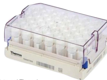
Nunc External Thread tube racked