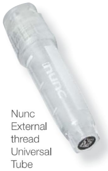
Nunc External thread Universal Tube