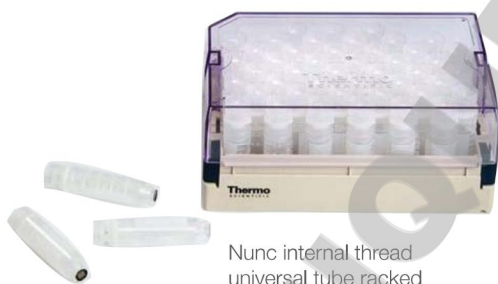
Nunc internal thread universal tube racked