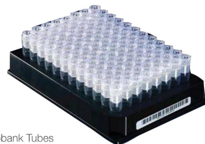
Nunc Cryobank Tubes in black locking rack