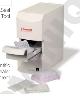
Thermo Scientific SuperSealer Instrument