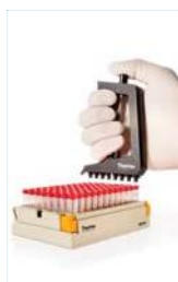
SepraSeal Removal Tool

Thermo Scientific™ Matrix™ SepraSeal™ septa enables individual tube capping plus the ability to apply 96 septa at once and store down to -20°C. Pre-split SepraSeal septa can be pierced multiple times. Permanently installed Thermo Scientific™ Matrix™ DuraSeal™ septa enable long-term storage at temperatures down to -150°C.