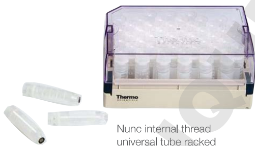
Nunc internal thread universal tube racked