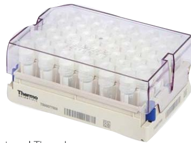
Nunc External Thread tube racked