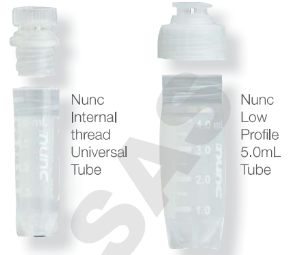
Nunc Internal thread Universal Tube

Ideal for cryostorage. Recommended for use from -150°C to -196°C in the vapor phase of liquid nitrogen.