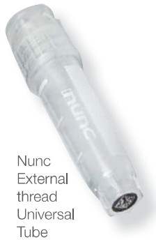
Nunc External thread Universal Tube