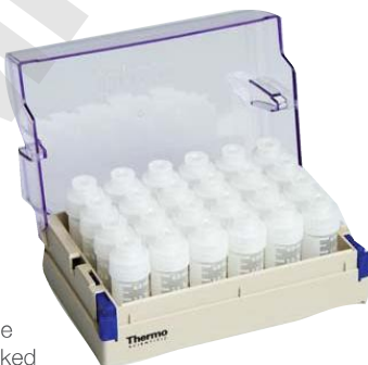
Nunc Low Profile 5.0mL Tube racked