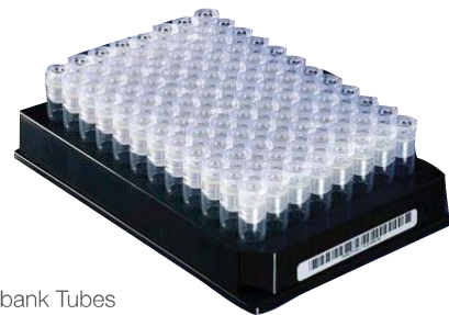
Nunc Cryobank Tubes in black locking rack