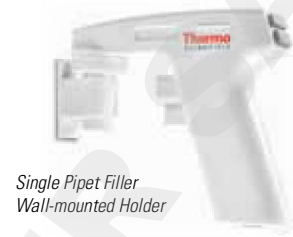
Single Pipet Filler Wall-mounted Holder

**Not available for use or sale within the United States or for importation into the United States.