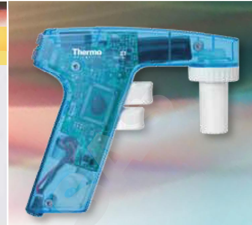
Thermo Scientific S1 Pipet Filler