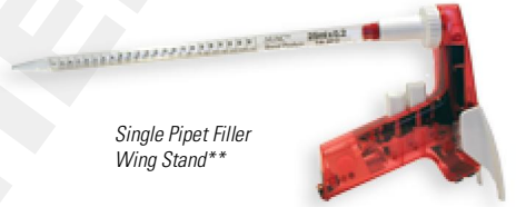
Single Pipet Filler Wing Stand**