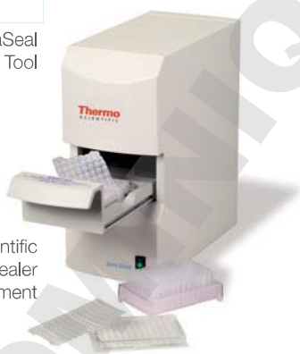
Thermo Scientific SuperSealer Instrument