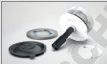
Lids for grinding vessels