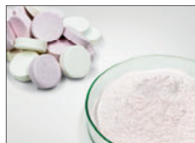
Cookies and vitamin tablets before and after comminution in the Knife Mill PULVERISETTE 11