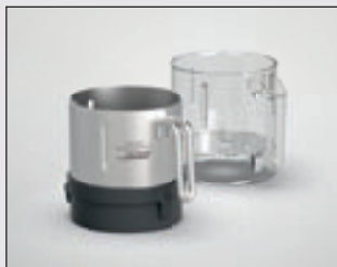
Grinding vessels 1.4 litre