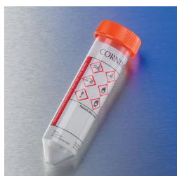
50 mL centrifuge tube with hazardous materials label