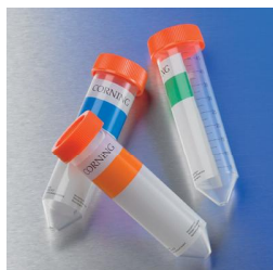
Easy ID color strip tubes