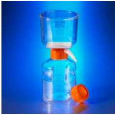
Vacuum Filtration Systems