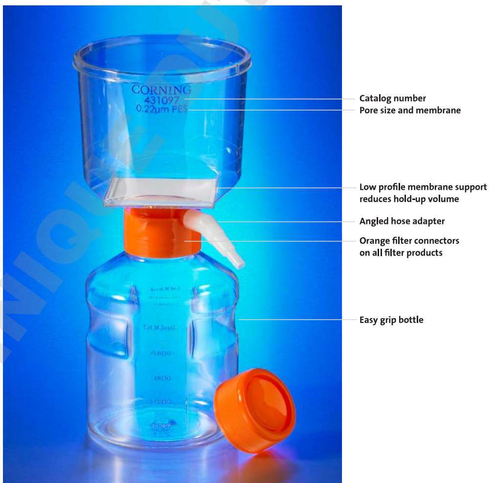
Corning® 500 mL filtration system with funnel and a 1,000 mL receiver bottle (Cat. No. 431097)

*1L Filtration System Benchmark Average Liquid Retention (n = 6).