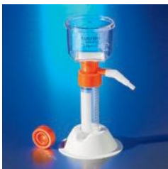
Tube Top Vacuum Systems