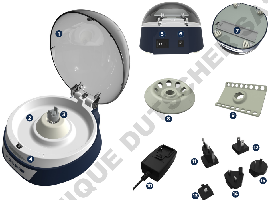
Figure 1 CENTRY™ 103 Minicentrifuge components