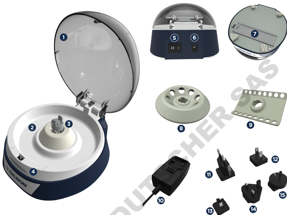
Figure 1 CENTRY™ 103 Minicentrifuge components