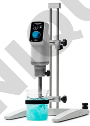
OV 625 Digital System