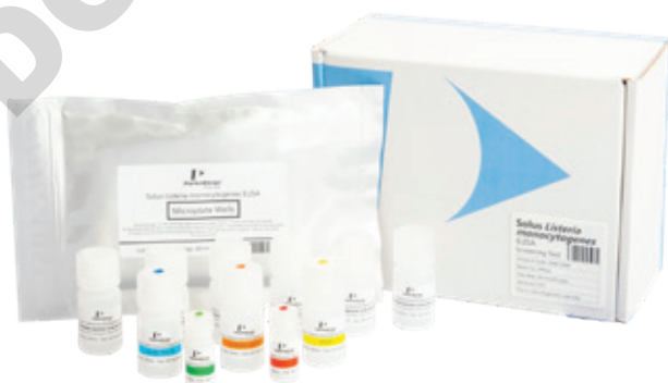
Solus Listeria monocytogenes ELISA Kit