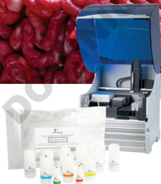
Solus™ Listeria monocytogenes ELISA Assay and Automated Workflow Package