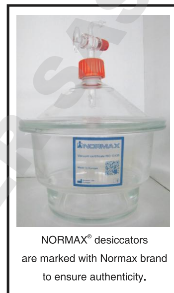
NORMAX® desiccators are marked with Normax brand to ensure authenticity.