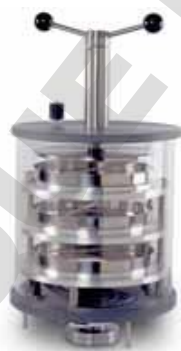
Large capacity stoppering chamber