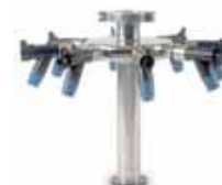
8 port manifold