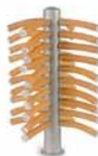
40 port manifold