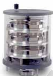
Large capacity chamber