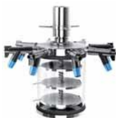
Standard stoppering chamber with 8 port manifold