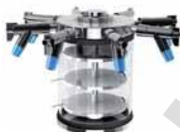
Standard chamber with 8 port manifold