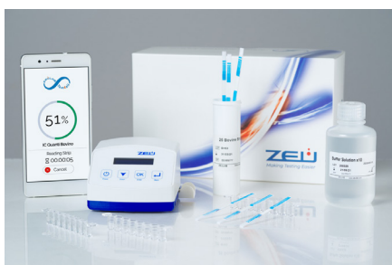
Quantification of cow's milk in sheep's milk and goat's milk.