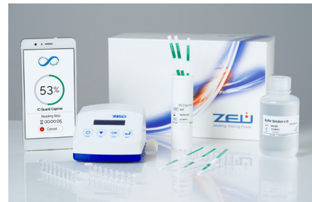
Quantification of goat's milk in sheep's milk