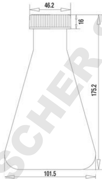
Cat. No. 73000/74000