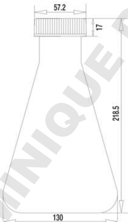
Cat. No. 73000/74000