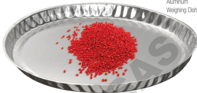
Aluminum Weighing Dish