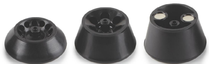
1.5/2.0 mL Tube Rotor