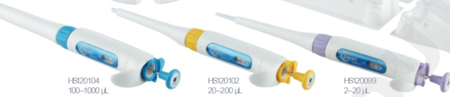
HSI20104 100–1000 µL