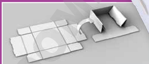
Trays are supplied "flat-packed"

Reducing the amount of space needed for storage