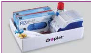
Use for storage or transport of laboratory products