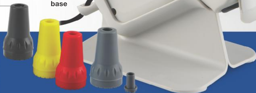
Benchtop charging base