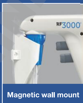
Magnetic wall mount