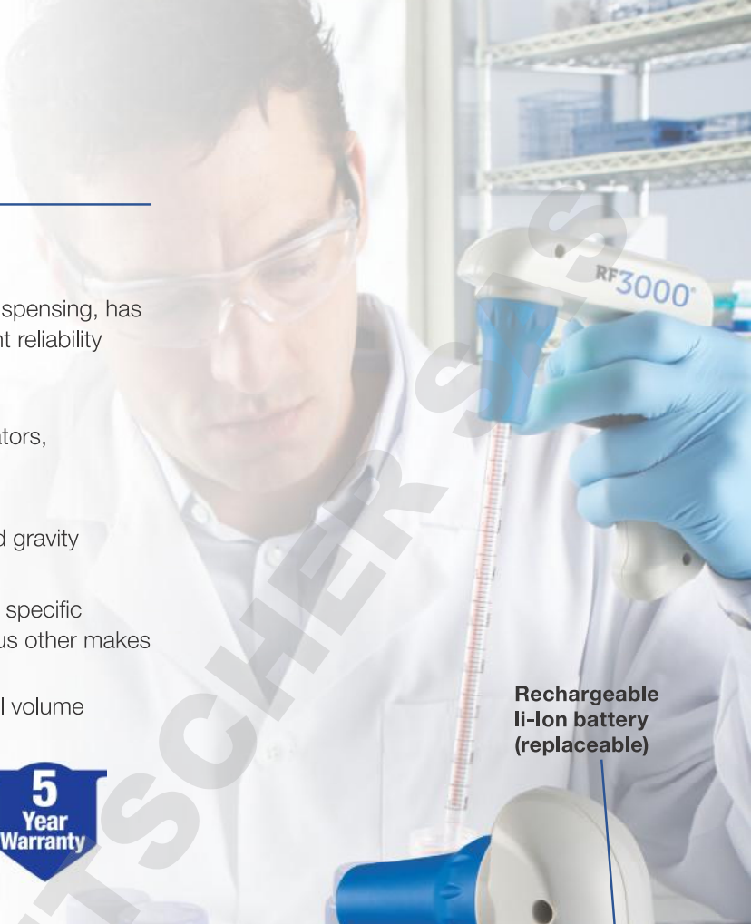
Rechargeable li-Ion battery (replaceable)