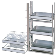
Wire shelves (left), Sliding racks (right)