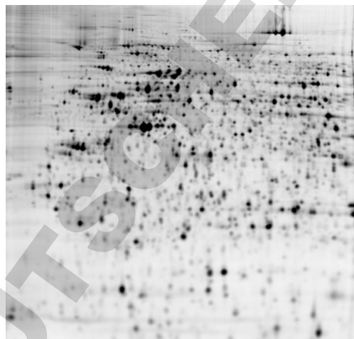
Fig 4. 2-D map image. HeLa reference sample (100 µg) labeled with CyDye™ DIGE Fluor, Cy™5 minimal dye. Sample preparation buffer = 8 M urea, 4% CHAPS, 20 mM DTT, 2% IPG Buffer 3–10. Immobiline DryStrip pH 4–7, 24 cm were rehydrated overnight at room temperature in 2 M Thiourea, 7 M Urea, 2% CHAPS, 20 mM DTT, 2% IPG buffer 4 to 7 in the IPGbox. First dimension separation run on Ettan IPGphor 3 IEF unit, anodic cup loading. Focused for 54 kVhr. Second dimension separation: 12.5% Lab-cast gel run on Ettan DALTwelve electrophoresis system.

Ettan IPGphor 3 with Ettan IPGphor Manifold offers a dedicated platform for running up to 12 first-dimension IEF separations with Immobiline DryStrip gels. Multiphor II Flatbed Electrophoresis Unit is another alternative. The excellent first dimension separation ensures that spots in the second dimension are well separated (Fig 4).