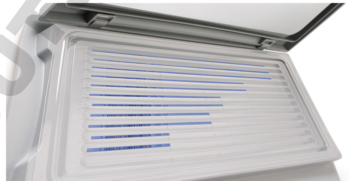
Fig 2. Reswell tray containing rehydrated strips with variable lengths.

2-D electrophoresis is a key technology for comparing complex protein mixtures from biological samples in proteomics research. We provide exceptional products for successful, highly reproducible 2-D electrophoresis using Immobiline DryStrip immobilized pH gradient gels rehydrated in an IPGbox, and focused in either IPGphor or Multiphor II for the first dimension followed by running SDS gels on Ettan DALT systems for the second dimension separation.