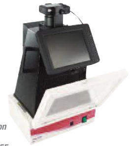
low cost gel documentation system, see page 52-55