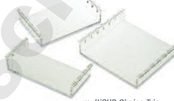
multiSUB Choice Trio includes all 3 tray sizes for optimum versatility and value