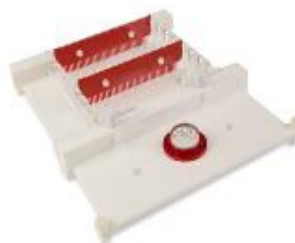
Figure 5 MS20-FC