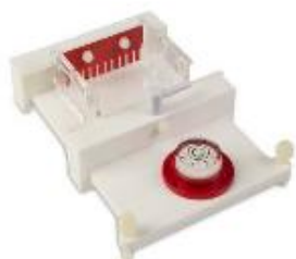
Figure 4 MS7-FC